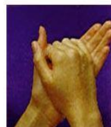
1. Rub palm to palm

Hand washing to be effective it must be done properly and all 6 steps