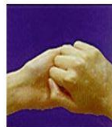
4. Fingers interlocked into palms