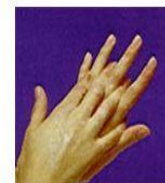
2. Rub palm over back of hand, fingers interlaced