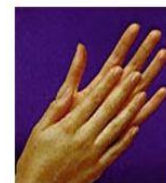
3. Palm to palm, fingers interlaced