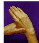
5. Rotational rubbing of thumb clasped into palm