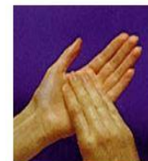
6. Rotational rubbing of clasped fingers into palm